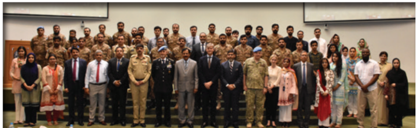
GROUP PHOTO - JINNAH AUDITORIUM