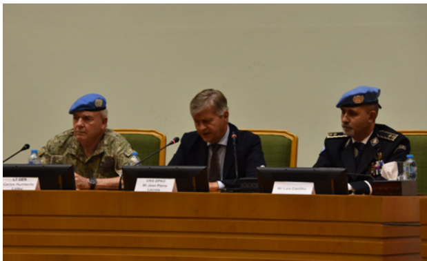
MEDIA & STUDENTS INTERACTION

The visit was followed by the interactive session with participants as well as media. This was held in Jinnah Auditorium. Students of Peace and Conflict Studies (PCS) and Peacekeeping Training Department (PKT) asked questions on various aspects of Peacekeeping which were comprehensively answered by the USG & panelist. At the conclusion of the visit the USG gave this statement: “Pakistan Army and Armed Forces contribution to our mission is really making a difference. We think it’s an outstanding contribution to the peace and stability in the world. In many cases our Peacekeepers make a difference between life and death to the vulnerable civilians. We have seen how much Pakistani Peacekeepers were helpful on protecting civilians. We are extremely grateful to Pakistan for its warm welcome and also for Pakistan’s outstanding contribution to UN Peacekeeping. It was also an opportunity to pay tribute to 156 Pakistani Peacekeepers who lost their lives serving the UN. We express special thought for them for their memory and also for their families. We also like to extend our gratitude to all Pakistani Peacekeepers currently serving in our missions as well as to their families. All of them are paying a price for that and we are extremely grateful” (see: https://www.youtube.com/watch?v=C8EHT2UOc40 ).