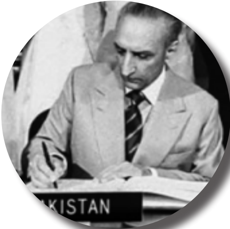
Sahibzada Yaqub Ali Khan SRSG-Western Sahara (1992-97)