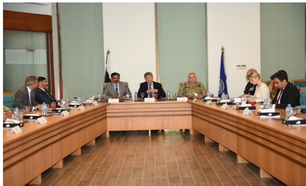
BRIEFING - CIPS