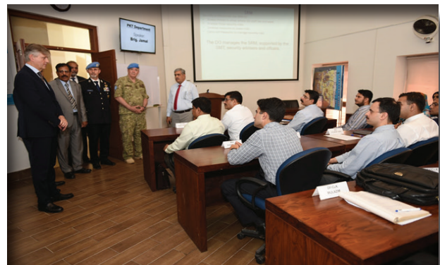
UN STAFF OFFICERS COURSE