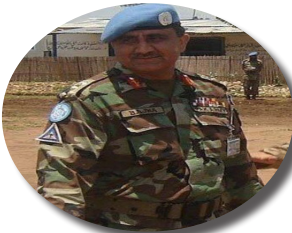
Gen. Qamar Javed Bajwa served as Brigade Commander in UN mission DRC Congo (2006-07)