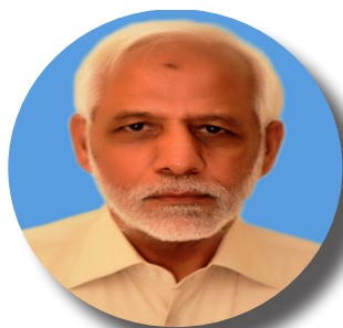
PRINCIPAL | Maj. Gen Furrukh Bashir (Retd) NUST Institute of Peace and Conflict Studies (NIPCONS)