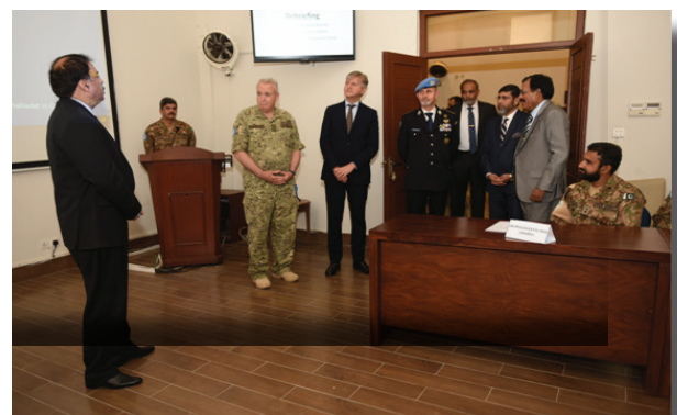
DISCUSSION - BEST PRACTICES/LESSONS LEARNT