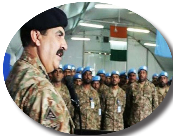
Gen. Raheel Shareef (Retd) visited Pakistan Army's UN contingent in Ivory coast (Nov, 2015)