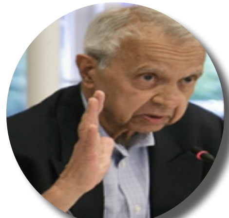
Syed Iqbal Riza SRSG-Bosnia (1996-97)