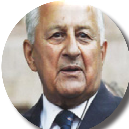
Sheharyar Khan SRSG-Rwanda (1994-96)